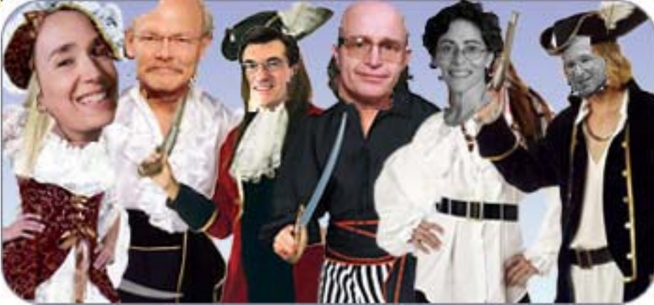
The Pirates of Cognitive Science