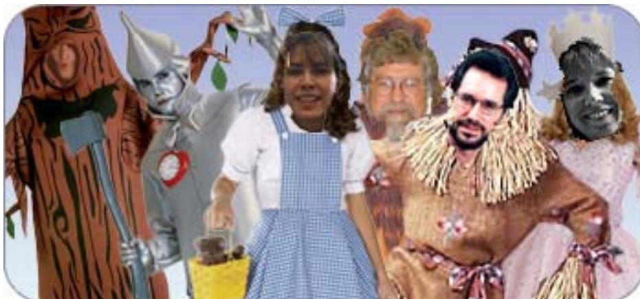
The Wizard of Health & Social Oz

Don't forget to stock your office with candy for the department Halloween Trick- or-Treaters... Coming Monday October 31!